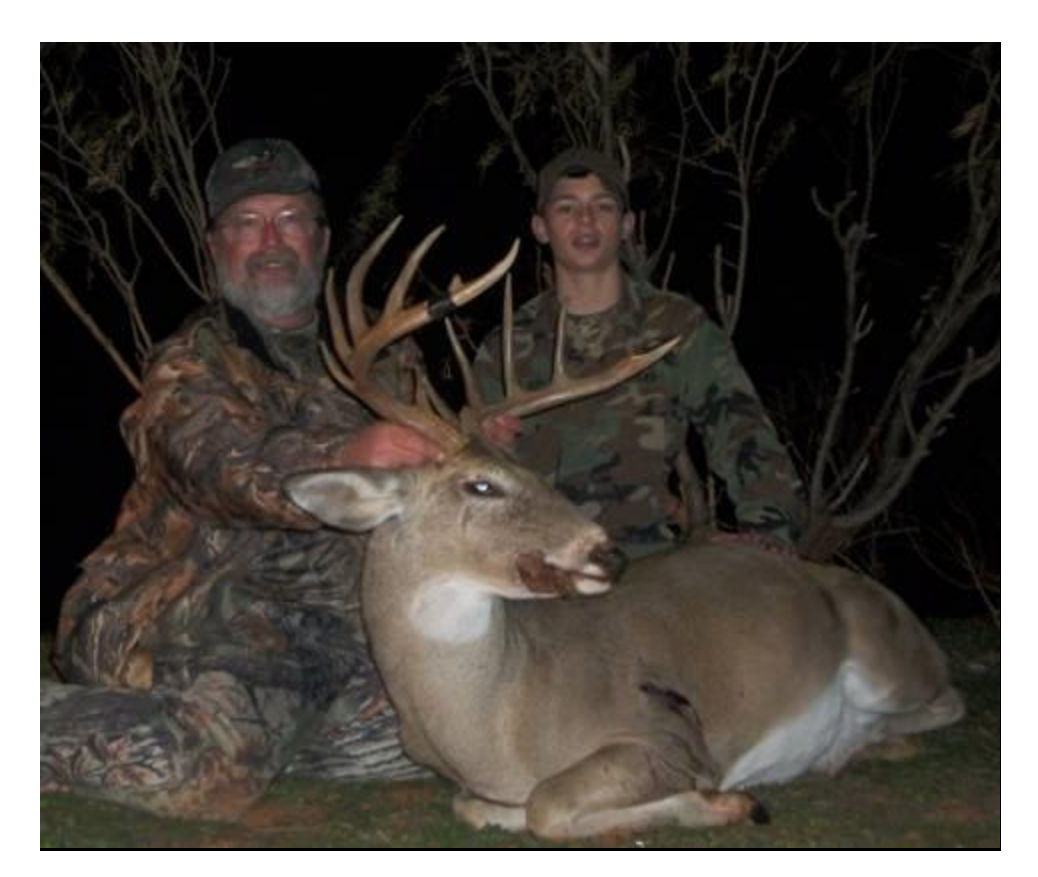
BEFORE AND AFTER OF THE SAME BUCK