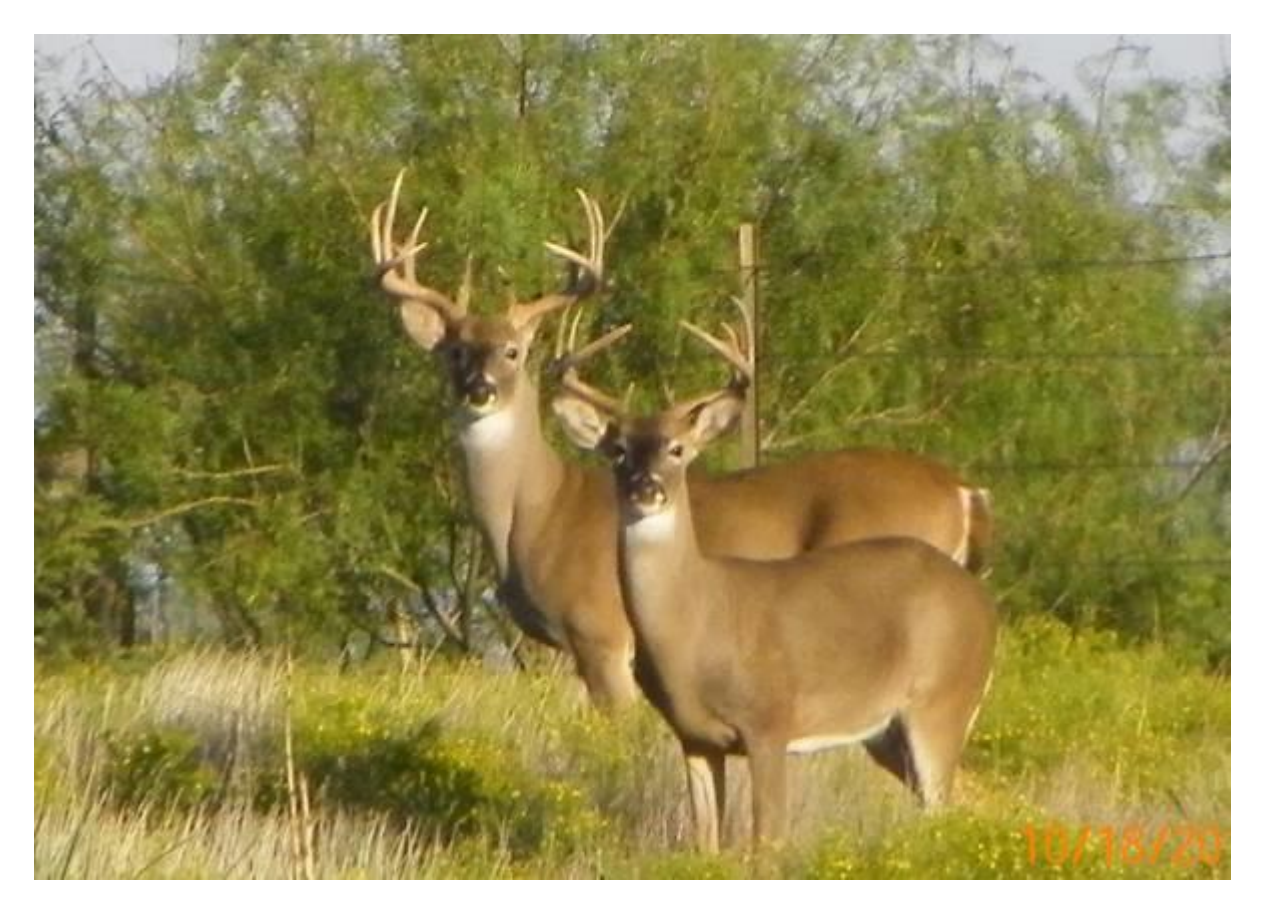
Hunt ID: TX-WDeer-YM4OURSE-SR-OB5B-Guided

Sell price: $3700 discounted down to only $2195 for the first deer and only $ 995 for the second deer. This is also a very high success on this free ranging whitetail hunt with success rates running 95% plus.