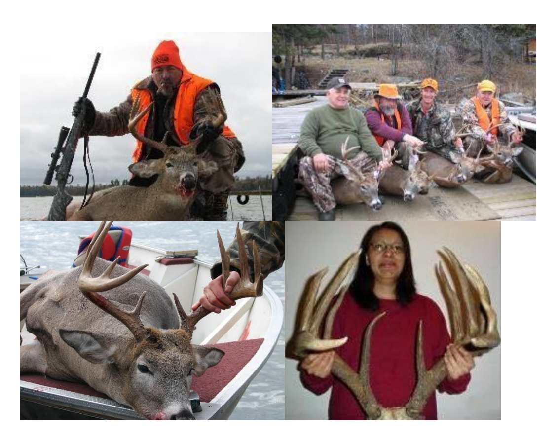
Hunt ID: CA-WDeerBearWolfDuckFish-All-Ontario-FNGS-Gerald

This Ontario Canada Outfitter are a complete hunting and fishing outfitter. Hunt with complete privacy with trophy class bucks on over 12,000 acres of private lands & miles of government crown lands to hunt. Also you can hunt waterfowl, bear, upland game and wolf along with fishing if you desire! The area will be crawling with orange vested deer hunter's this fall. Our area has become renounced for it's Boone & Crocket Trophy Buck potential. We are happy to have a large population of deer and a 130 to 160 class buck can be quite common. Every year we will take 2 or 4 deer ranging from 250# up to 330# (big bodied). Still hunting or standing is a common hunting method although guided pushing could be incorporated on that warm day when the deer don't move. We can accommodate up to (6) hunters per group. For inland hunts, hunting areas are usually accessible by truck. We do have (2) ATV's available upon request.