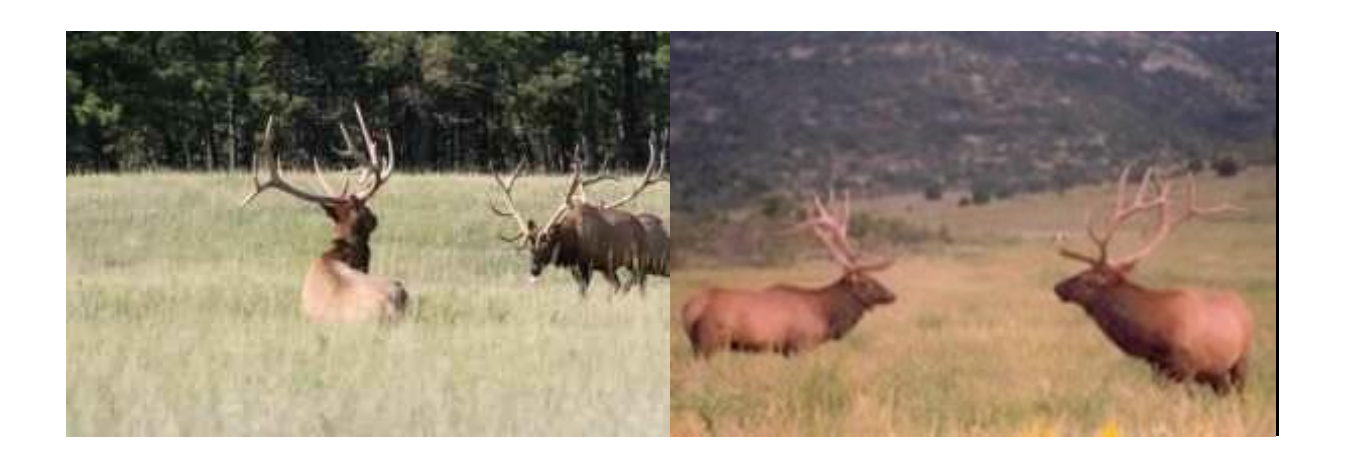
Hunt ID: NM-BElk-INIC6ACL-R8R-ER9TROB