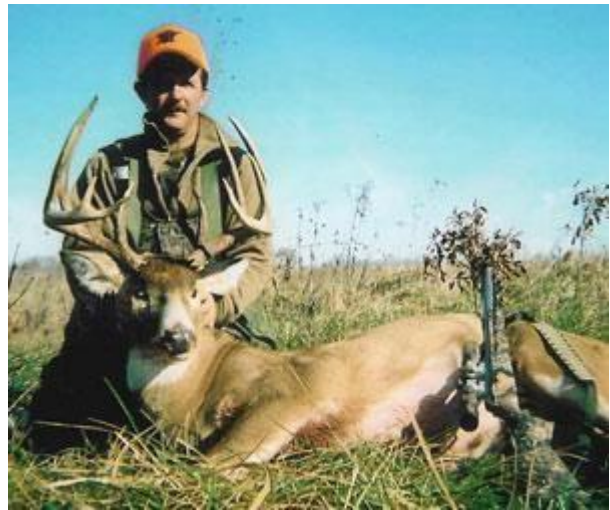
Who says, you can't take a 180 inch plus with during Late Muzzleloader Season.