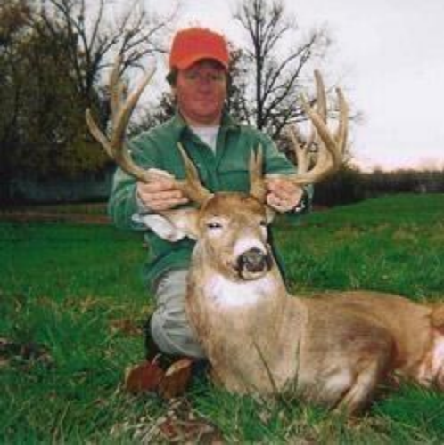
Missouri Firearm Monster of 214 inches