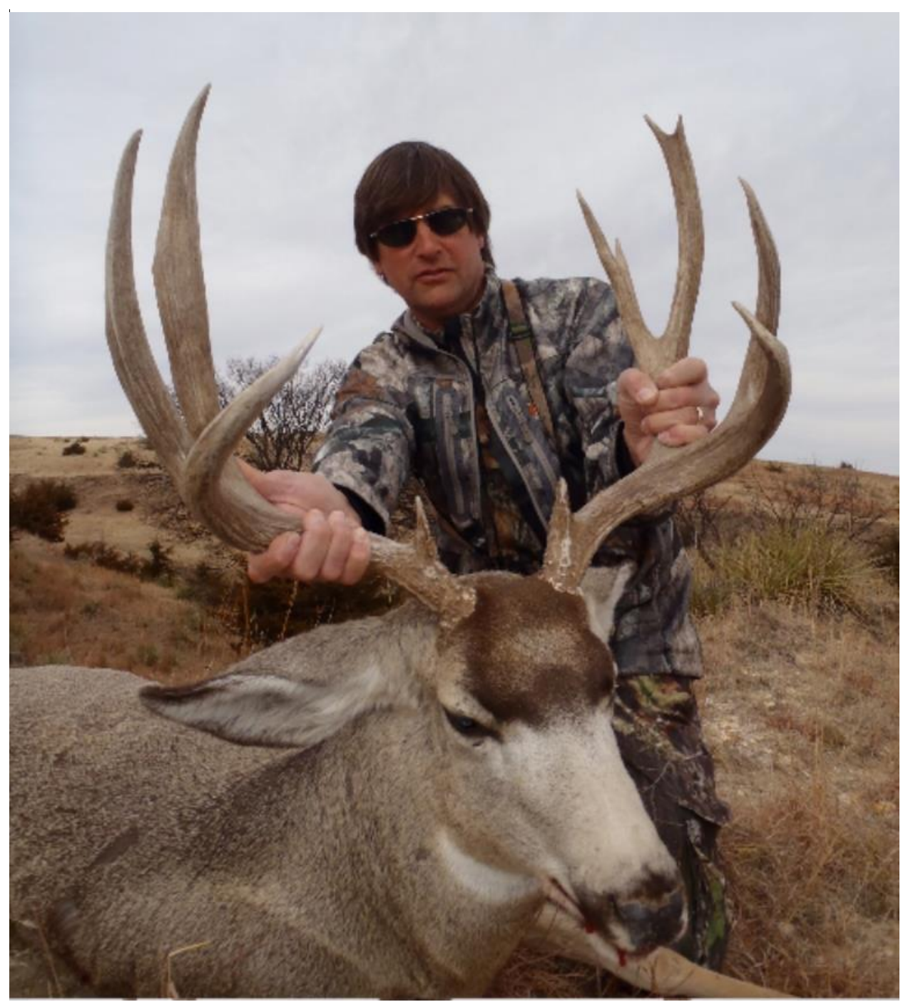
Good place for 150-180 Class Mule Deer like this one with in-town lodging & Meals