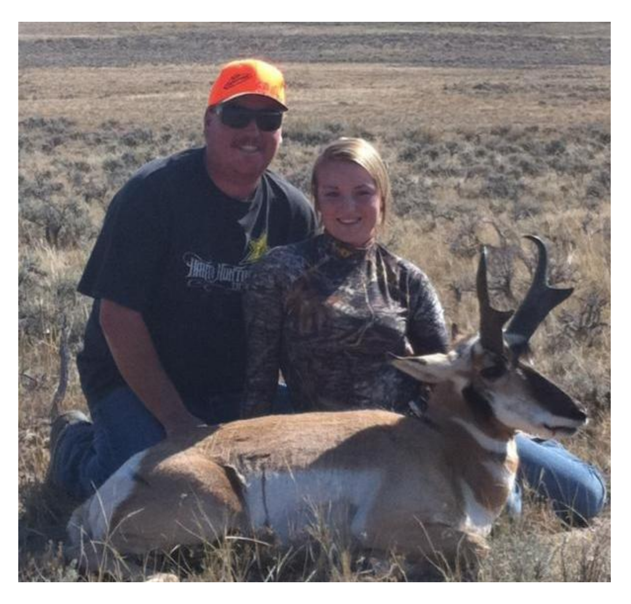
Hunt ID: 5028-S-N-1495-ElkMDeerAntelope-CO-003-IG4CRA-RM5O-DN7EYRO-Easy Hunting Country

The Highly discounted hunts and great deals are sent to the "Preferred Outfitters" first before they even make the web site. Because of this many times the Preferred Hunters buy the out and they never make the web site. If you would like to be on the Preferred Hunters List so you receive these hunts as soon as they are available please contact me, EMAIL us and I will put you on the Preferred Hunters List.