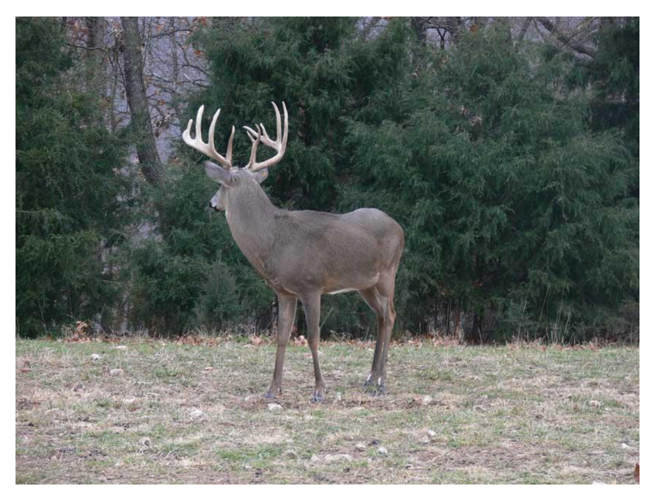
Hunt ID: 6020-NE-G-C-2800-Platte-MDeerWDeer-TH2URAR-RE1-R2RYTE-E2RICH

Picture yourself in the wide-open spaces of the Nebraska Sandhills. Sand dunes frozen in time by a waving carpet of tall grasses and wildflowers, dotted with leadplant, yucca and wild rose. Freshly harvested corn and alfalfa fields lay in the valley. The air is crisp and clean. Autumn's golden colors fill the vista as you look across the valley at daybreak. You are ready to hunt the ancient prairie chicken or the sharp-tailed grouse; the majestic mule deer or elusive whitetail deer; or the wild dog of America, the coyote.