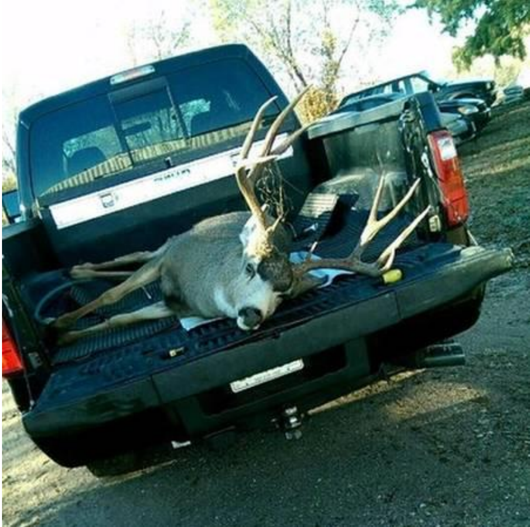
Hunt ID:6005-NE-S-M-1900-NP-MDeerWDeerTurkey-ATTEN7ORTHPI-L2LBI-Good MDeer