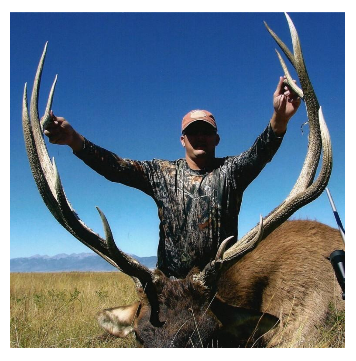
Hunt ID:5105-CO-GD-CM-5500-082-ElkMDeerAntelope-FA3TMOF-OP1-IA2NBR-Low Impact Valley Hunts

SPECIAL Hunt in the San Luis Valley for an Economy Bull Elk Hunt on private land in the San Luis Valley. This is a low impact hunt that has provide us some very fine bulls in the past. The mode of hunting is from a 4-wheel drive truck driving and glassing from county roads and two-tracks through the private land. The outfitter has taken over 800 elk this way so I consider him as the best there is for success on a low Impact hunt.