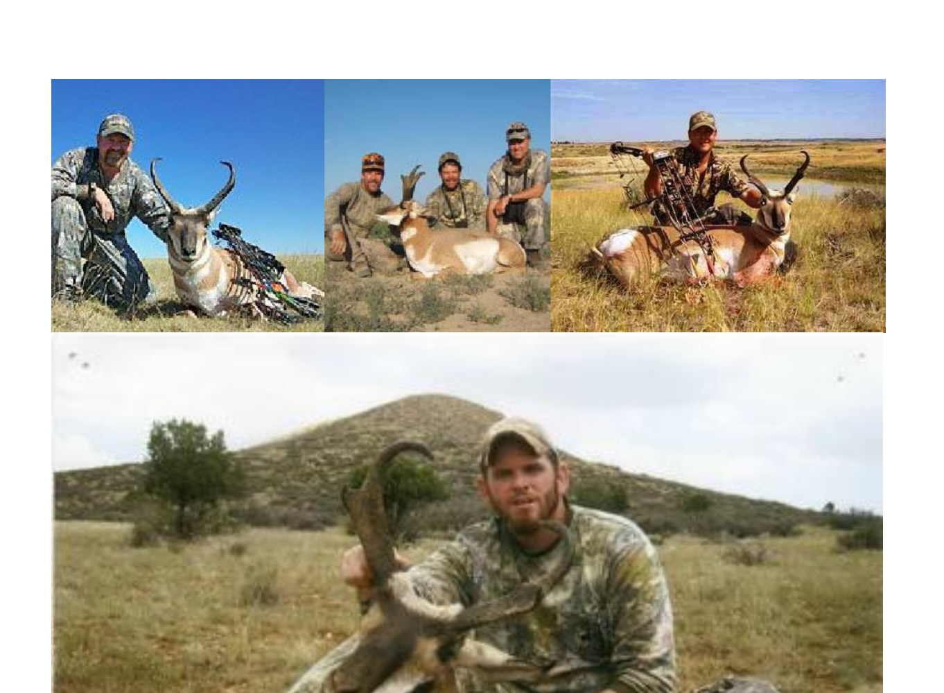
ANTELOPE HUNTS: $ 2195 reduced down to only$1495 per person, fully guided, (5 days of hunting (Voucher extra if required.) Archery antelope hunts take place during late August and September while the rifle season begins in early October. For archery hunts we will primarily hunt from blinds which we set along fence lines where the antelope naturally cross during the day as they move between the alfalfa fields. Rifle hunts involve more spot and stalk tactics. Preference points are necessary to draw licenses, but if you contact us early in the year we may be able to secure a guaranteed land owner sponsored license for you. All hunts are fully guided and include five days of hunting. After you secure your license we will set dates for your hunt. Our antelope tend to score will with the mass because they generally have heavy bases but not overly long horns. The guiding on this hunt is 1 on 1 most of the time.